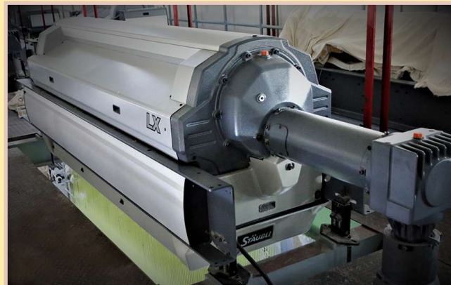
LX & SX Staubli Jacquards Machine