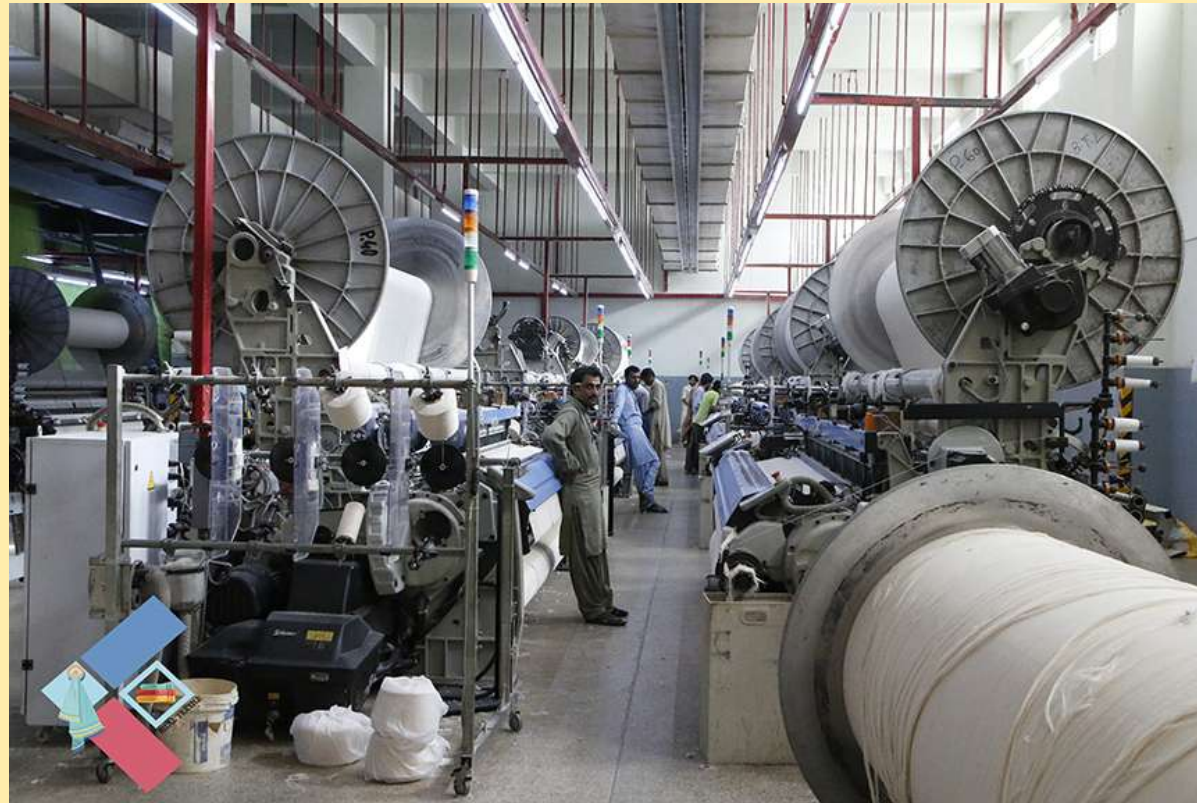
10 R9500 ITEMA shuttle less Dobby Looms

BILAL TEXTILE Manufacturer-Exporter of Terry Towels & Home Textiles