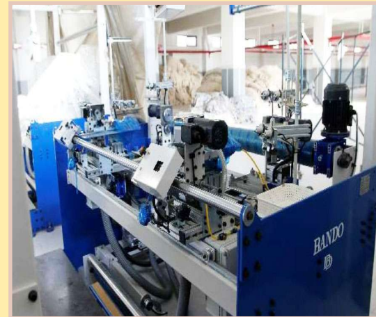
2 Bando Double Needle Chain Stitch Machine