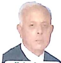
Ghulam Sarwar Federal Minister for Petroleum