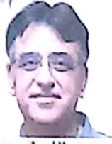
Asad Umar Federal Minister for Finance