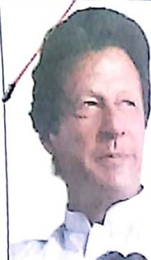
Imran Khan Prime Minister of Pakistan