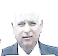
Chaudhry M. Sarwar Governor Punjab