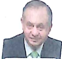
Abdul Razak Dawood Advisor to PM on Commerce, Textile, Industry & Production and Investment