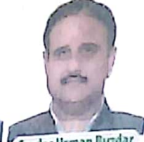
Sardar Usman Buzdar Chief Minister Punjab