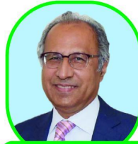
Dr. Abdul Hafeez Sheikh

Adviser to Prime Minister of Pakistan on Finance & Revenue