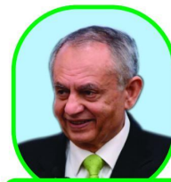
Abdul Razak Dawood

Adviser to Prime Minister of Pakistan on Finance & Revenue