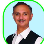
Omar Ayub Khan